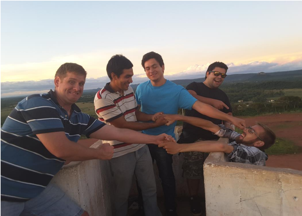
SPREADING GOD'S LOVE IN PARAGUAY WITH THE POWER OF MUSIC