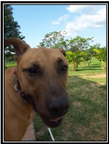
Sampson is a 5 year-old German Shepard mix who is enjoying his new life in Paraguay. He's made lots of new friends and is currently learning how to bark in Spanish.